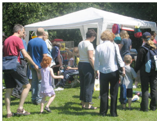
Ferrets in Need at Risley Moss, 2005

It's particularly pleasing to be able to record that none of the competitors failed their mandatory Ferretone tests.